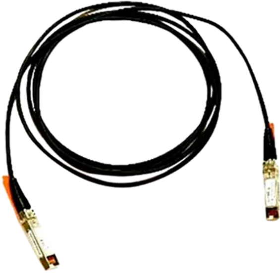
Figure 4. Cisco direct-attach twinax copper cable assembly with SFP+ connectors

Cisco SFP+ Copper Twinax (Figure 4) direct-attach cables are suitable for very short distances and offer a cost-effective way to connect within racks and across adjacent racks. Cisco offers passive Twinax cables in lengths of 1, 1.5, 2, 2.5, 3, 4 and 5 meters, and active Twinax cables in lengths of 7 and 10 meters.