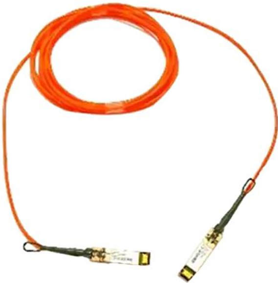
Figure 5. Cisco direct-attach active optical cables with SFP+ connectors

Cisco SFP+ Active Optical Cables (Figure 5) are direct-attach fiber assemblies with SFP+ connectors. They are suitable for very short distances and offer a cost-effective way to connect within racks and across adjacent racks. Cisco offers Active Optical Cables in lengths of 1, 2, 3, 5, 7, and 10 meters.