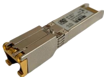
Figure 2. Cisco SFP+ 10GBASE-T module with RJ-45 connector

The Cisco 10GBASE-T module (Figure 2) offers connectivity options at the following data rates: 100M/1G/10Gbps. It has the SFP+ form factor and an RJ-45 interface so that CAT5e/CAT6A/CAT7 cables can be used to connect to end points with embedded 10GBASE-T ports. They are suitable for distances up to 30 meters and offers a cost-effective way to connect within racks and across adjacent racks.