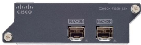
Figure 7. Cisco FlexStack-Extended: Fiber module