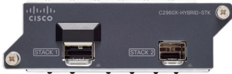
Figure 6. Cisco FlexStack-Extended: Hybrid module