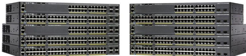
Figure 1. Cisco Catalyst 2960-X Series Switches

Cisco® Catalyst® 2960-X and 2960-XR Series Switches are fixed-configuration, stackable Gigabit Ethernet switches that provide enterprise-class access for campus and branch applications (Figure 1). They operate on Cisco IOS® Software and support simple device management as well as network management. The Cisco Catalyst 2960-X and 2960-XR Series provide easy device onboarding, configuration, monitoring, and troubleshooting. These fully managed switches can provide advanced Layer 2 and Layer 3 features as well as optional Power over Ethernet Plus (PoE+) power. Designed for operational simplicity to lower total cost of ownership, they enable scalable, secure, and energy-efficient business operations with intelligent services. The switches deliver enhanced application visibility, network reliability, and network resiliency.