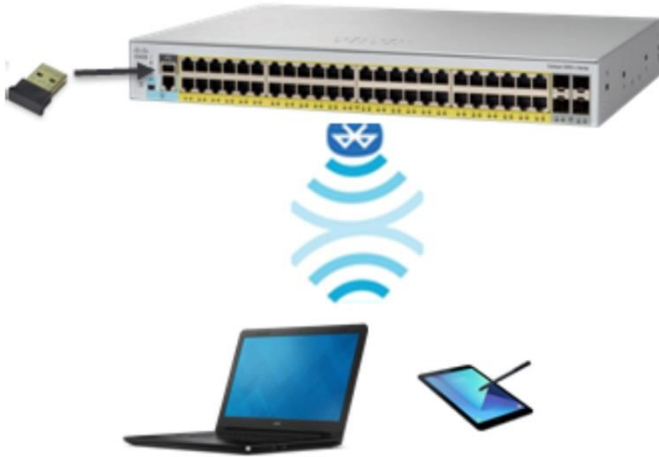
Figure 4. Over-the-air switch access using Bluetooth