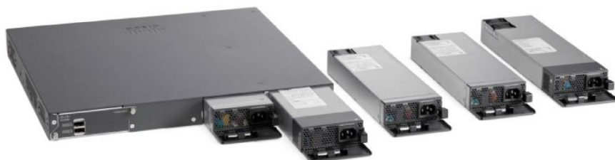
Figure 2. Cisco Catalyst 2960-XR Series power supply

Dual redundant power supplies are supported on the Cisco Catalyst 2960-XR Series Switches. These switches ship with one power supply by default. The second power supply can be purchased at the time of ordering the switch or as a spare. These power supplies have built-in fans to provide cooling (Figure 2).