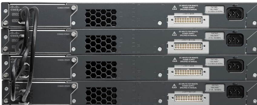
Figure 5. Cisco FlexStack-Plus switch stack