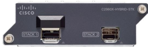
Figure 6. Cisco FlexStack-Extended: Hybrid module